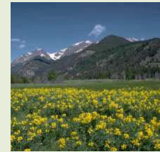
Rocky Mountain National Park, help ensure permanent protection!

The Rocky Mountain National Park and Dominguez Canyons wilderness proposals are one major step closer to becoming reality! Both proposals, as part of the Omnibus Public Land Management Act of 2009, were passed by the Senate by a vote of 73-21 on January 15th, 2009.