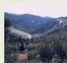
Wildcat Canyon (pre-Hayman).