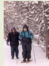
Come snowshoe with us!

The first in a series of exploratory hikes to wilderness candidates beyond the Wild Ten. Wildcat Canyon encompasses rugged portions of Tarryall Creek and the South Platte River. Come help determine if the areas wild values are worth preserving on this moderately strenuous 6-mile hike with 750-foot elevation gain, sponsored by Pikes Peak Sierra Club, Wild Connections, and Central Colorado Wilderness Coalition.