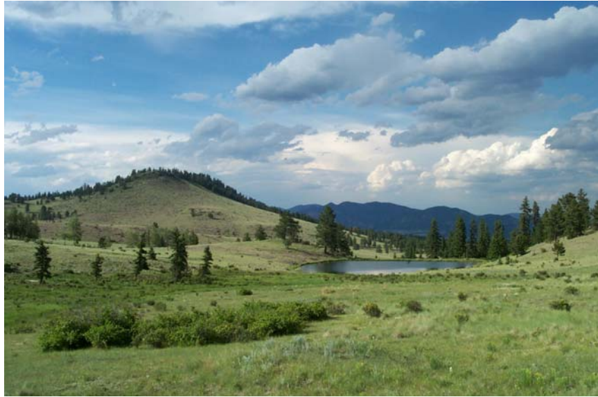
Thirtynine Mile roadless area