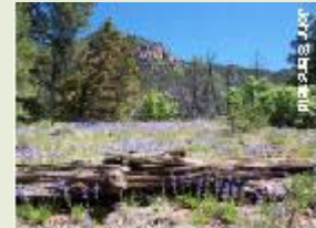
Lupines in West Bear Gulch of Grape Creek.