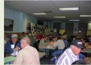
Forest Service public meeting in Westcliffe, 2007. Why do you value your public lands?

The Pike-San Isabel National Forest, responsible for managing 2.2 million acres of our local forest lands, announced it will restart their forest plan revision. After the first round of public meetings in early 2007, a court decision put the process on hold. Now they are ready to restart their plan revision. It is anticipated that the Pike-San Isabel will hold the next round of public meetings in late summer. The Forest Plan is the overall vision document which will guide management decisions for the next 15 years. Stay tuned for more details.