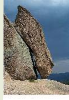
Granitic boulders in Rampart Range Roadless Area.

Join Pikes Peak Sierra Club Group on an exploratory hike of the Rampart East Roadless Area, west of Palmer Lake, aimed at mapping the southern boundary of the area. Participants will have the opportunity to learn the basics of GPS navigation as it applies to mapping and recording natural features of an area with potential as a wilderness area. This will be a strenuous six-mile hike, partially off trail, with a maximum of 1,500 feet in elevation.