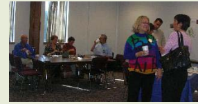
Citizens Speaking up for our natural heritage - Pueblo

Conservationists and Wild Connections staff attended the Pike-San Isabel (Pueblo) and Denver open houses.