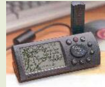
Um, what button do I push?

Got a GPS unit for Christmas and still not sure how to use it? Learn the basics of GPS navigation and the wilderness future of Thirty-nine-mile and other nearby Wild Ten areas on this hike. Aspen groves should be prime for photography, too. The moderately-strenuous six-mile hike, on and off trail, will gain a maximum of 1,000 feet in elevation. Well-behaved, leashed dogs welcome.