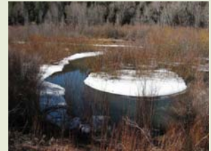
Trout Creek Riparian Area.

Wild Connections needs volunteers to help reclaim critical habitat for two threatened or endangered species in a riparian area in the Trout Creek and Eagle Creek drainages on the Rampart Range. Pawnee montane skipper butterflies live only in limited areas along this part of the South Platte River watershed and Preble's meadow jumping mice live in relatively few riparian areas along the Front Range.