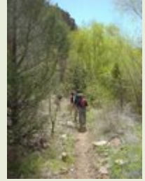
Solitude in Beaver Creek

On its way downward from the summit of Pikes Peak to the Arkansas River, Beaver Creek snakes through spectacular granite-walled canyons. Spring is a great time to visit. Come explore this wild land gem on a moderately strenuous seven mile hike with elevation gain of 1,000 feet, sponsored by Pikes Peak Sierra Club Group, Wild Connections, and Central Colorado Wilderness Coalition. We will experience solitude only a few miles from the urban roar and learn about the wilderness future of this and other nearby natural areas.